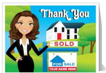
Real Estate Agent